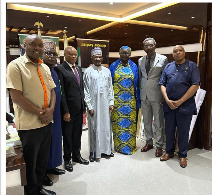
Meeting with MOL, Nigeria