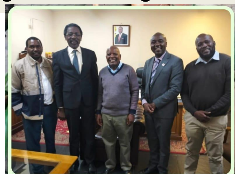
Meeting with MOL Zimbabwe