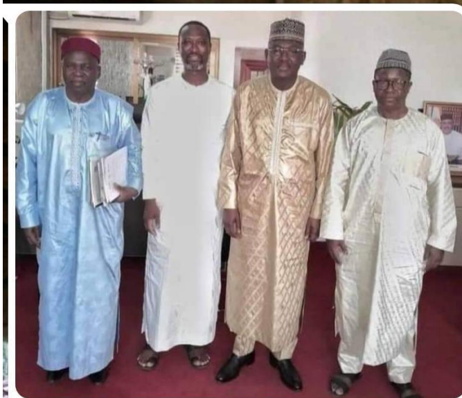
July 2023. Meeting with MOL of Niger