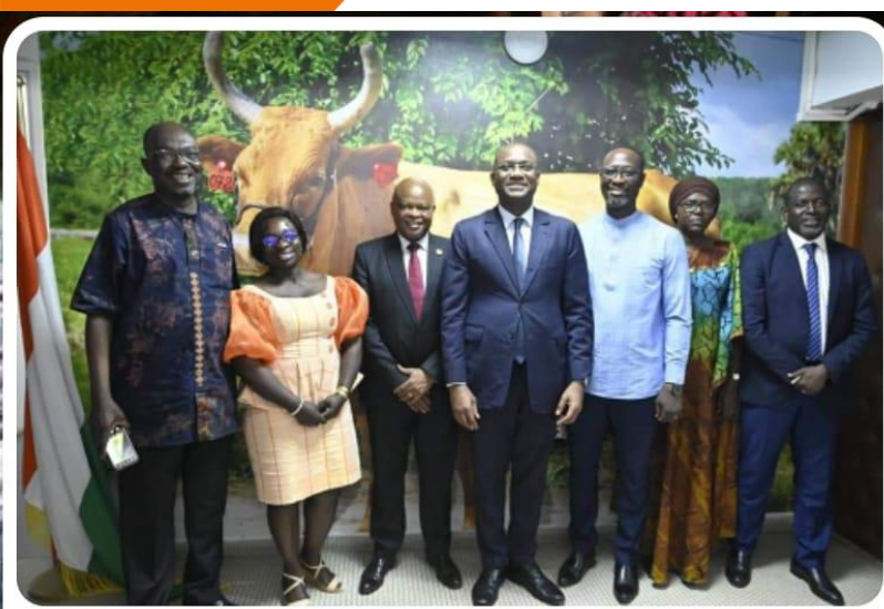
May 2023 Meeting with MOL of Côte d'Ivoire