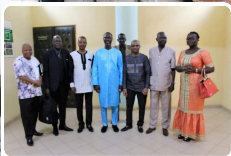
May 23. Meeting with MOL Burkina Faso