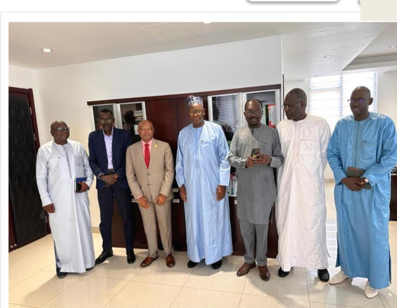
Meeting with MOL, Senegal