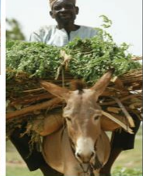
Integrating the Welfare Interests of Human and Animals in Africa